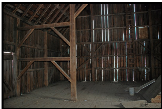
Barn interior shows the post, beam and peg construction of the early Woodbury barns.