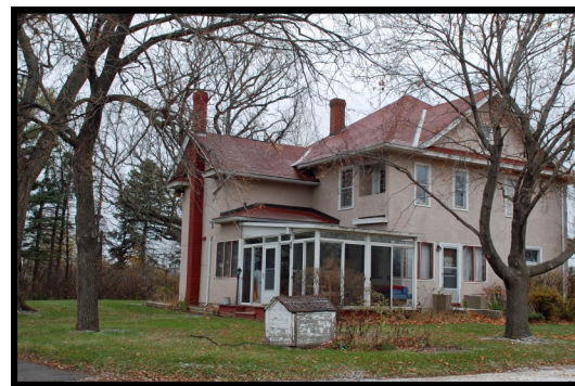
Bielenberg farm house. Orville Bielenberg was the first mayor of Woodbury

farmstead. The farmstead is located within the Valley Creek Open Space just northeast of the intersection of Valley Creek Road and Settlers Ridge Parkway. The city has various buildings and properties with which no decision has been reached for their development or future use. In order to familiarize the stake holders, a tour will be conducted of various open spaces on Tuesday, April 5, 2011 and members of the WHS Board have been invited to attend along with members of the City Council and Parks Commission. The tour will leave City Hall at 5:30 p.m.. The tour will include the Afton Road Baptist Church (former Woodbury Community Club),