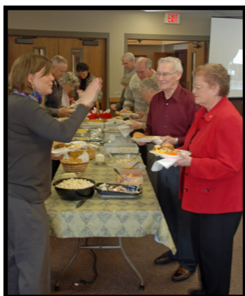
No shortage of food