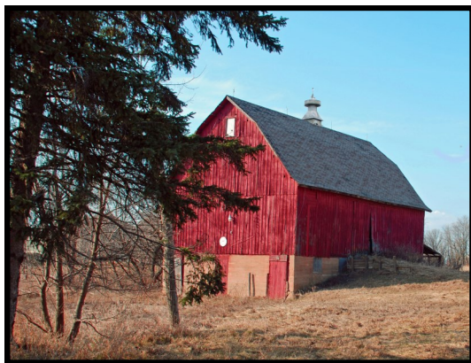
The Miller Barn is located in the Valley Creek Open Space