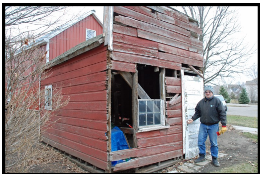
Woodbury's first post office.

(Valley Creek Barn) Barn, the Bielenberg farm house, Woodbury's first post office, and District 28 School.