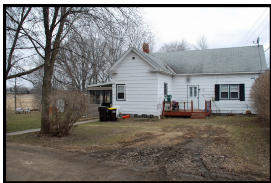
District 28 School or was also known as the Schilling School

A landscape architect has been hired by the WHS Board to make a rendition of what the village would look like in the site.