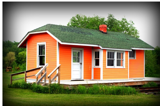
Afton: Chicago, Milwaukee, St. Paul and Pacific Railroad Depot Built 1883