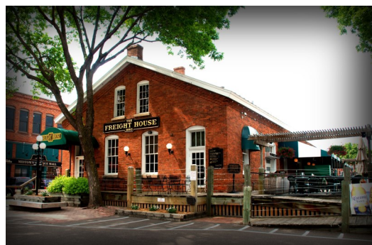
Stillwater: Chicago, Milwaukee and St. Paul Freight House and Depot Built: 1882