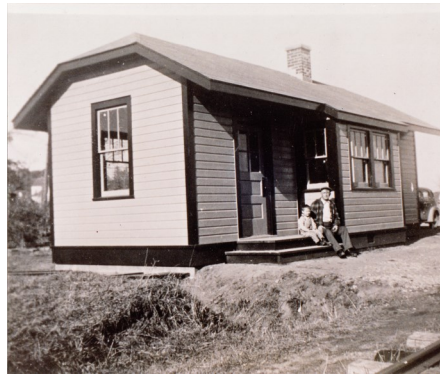
Afton Depot circa 1930