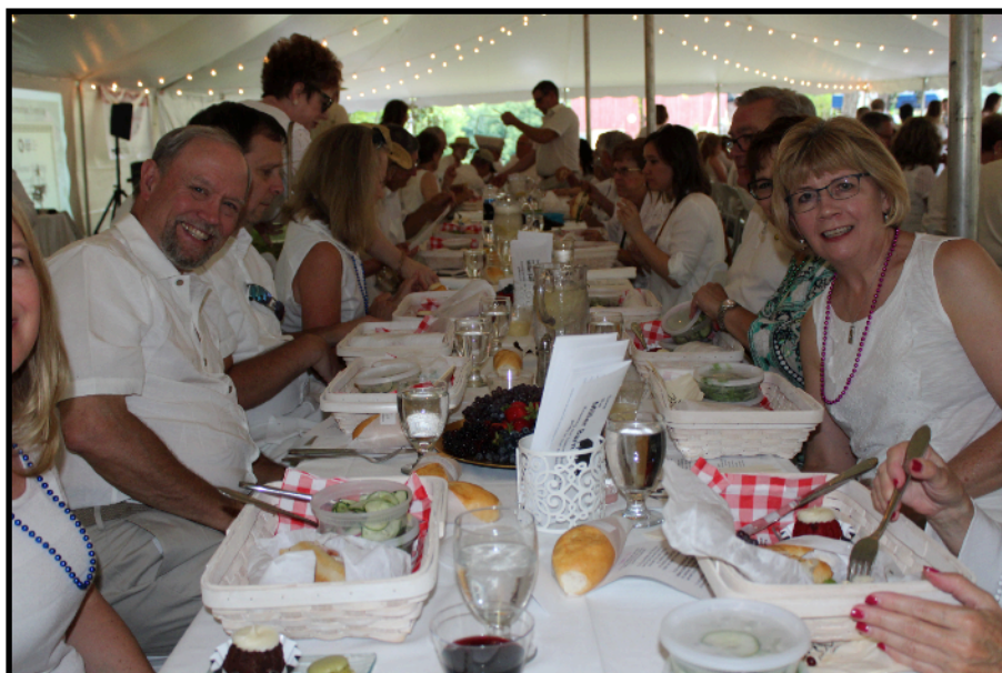
The Nelson family and guests at the 2018 white picnic fundraiser.

Recipe for Quarreling: Steep a sassafras root in a pint of water and put it in a bottle. When your mate comes in to quarrel, fill your mouth with it and hold until he goes away. A sure cure.